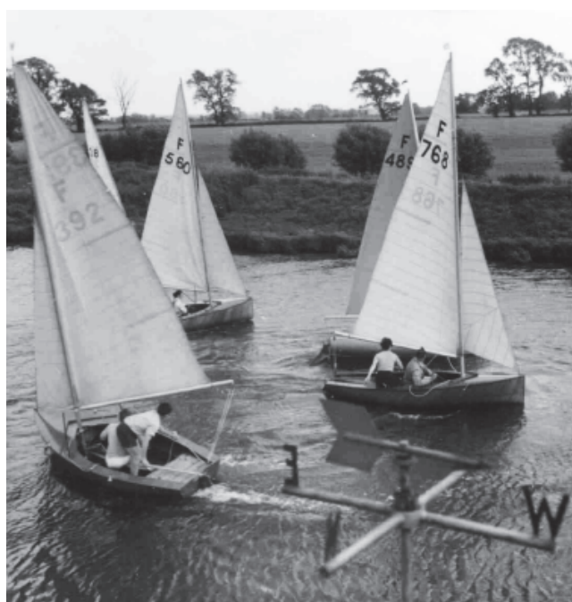
Dinghy Racing in 1947

In April 1939 plans were put forward for a slipway on the field together with a boat storage shed. Application was made to the Playing Fields Association