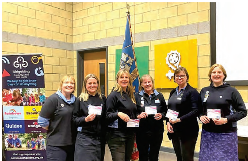
Leaders from Girlguiding Waterbeach celebrating at County Awards

A big well done and thank you to the following as we recognise their contributions