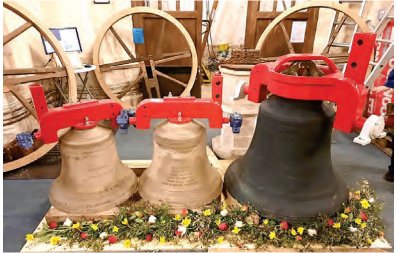
The 500 year-old tenor bell that had its headstock renewed, and the two new bells "Coronation" and "Community", waiting to be hung in the tower.

After 500 years of bells being rung in All Saints' Church, Landbeach, there are now, for the first time ever, six bells in the tower (and including one 500 year-old bell; the tenor). Years of planning and fund raising (the "Six Appeal") saw the installation of two new bells, embossed "Coronation – King Charles III" and "Community", completed in April; (just!) in time to ring out across the fens as part of an inaugural concert on the last Saturday of April, and in a service for their dedication on the Sunday.